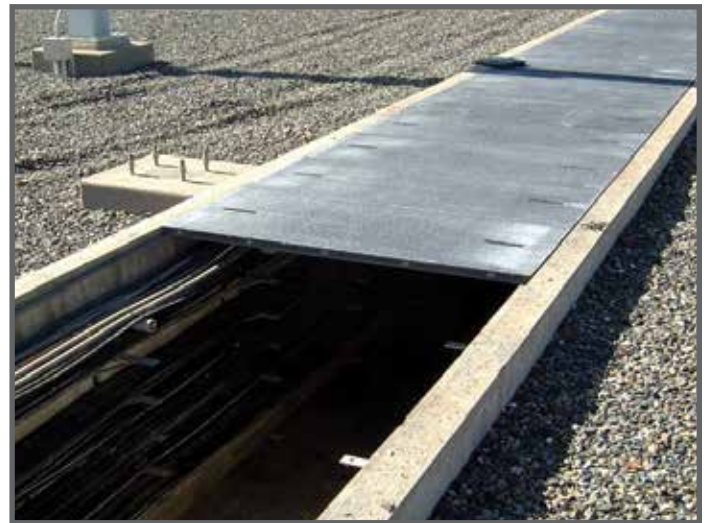
Solid GRP Trench Covers