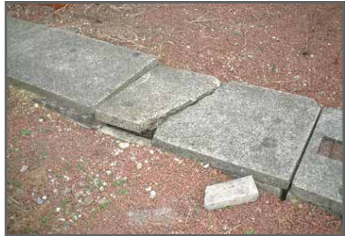
Traditional Concrete Trench Covers

Why not provide an aesthetically pleasing Fibergrate GRP cover that will continue to provide durability and safety for years to come?