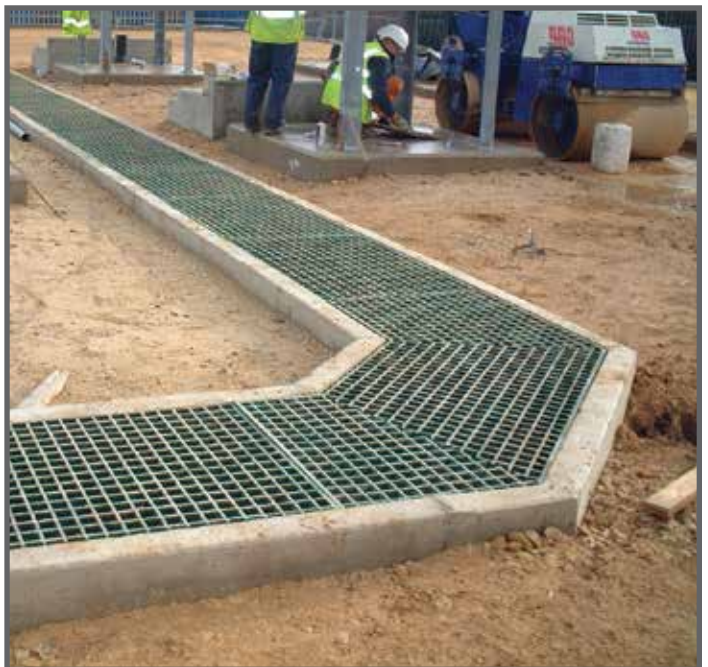
After Installation of GRP Trench Covers